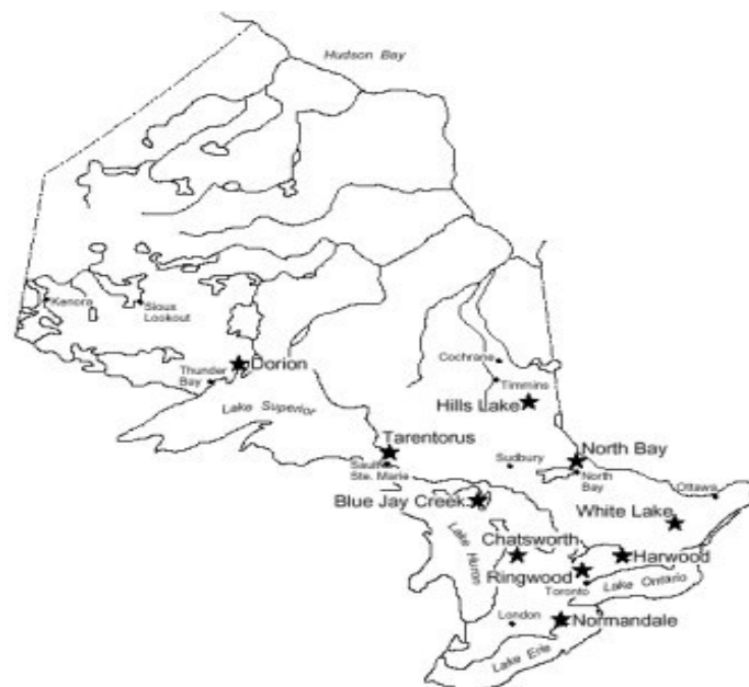
Figure 1. Location of OMNRF Fish Culture Stations. Ringwood Fish Culture Station is currently being operated by a partner.

OMNRF operates nine Fish Culture Stations (FCS) throughout the province (Figure 1), raising more than 7 million fish each year for stocking in local waterways for species restoration, wild population enhancement and recreational fishing opportunities.